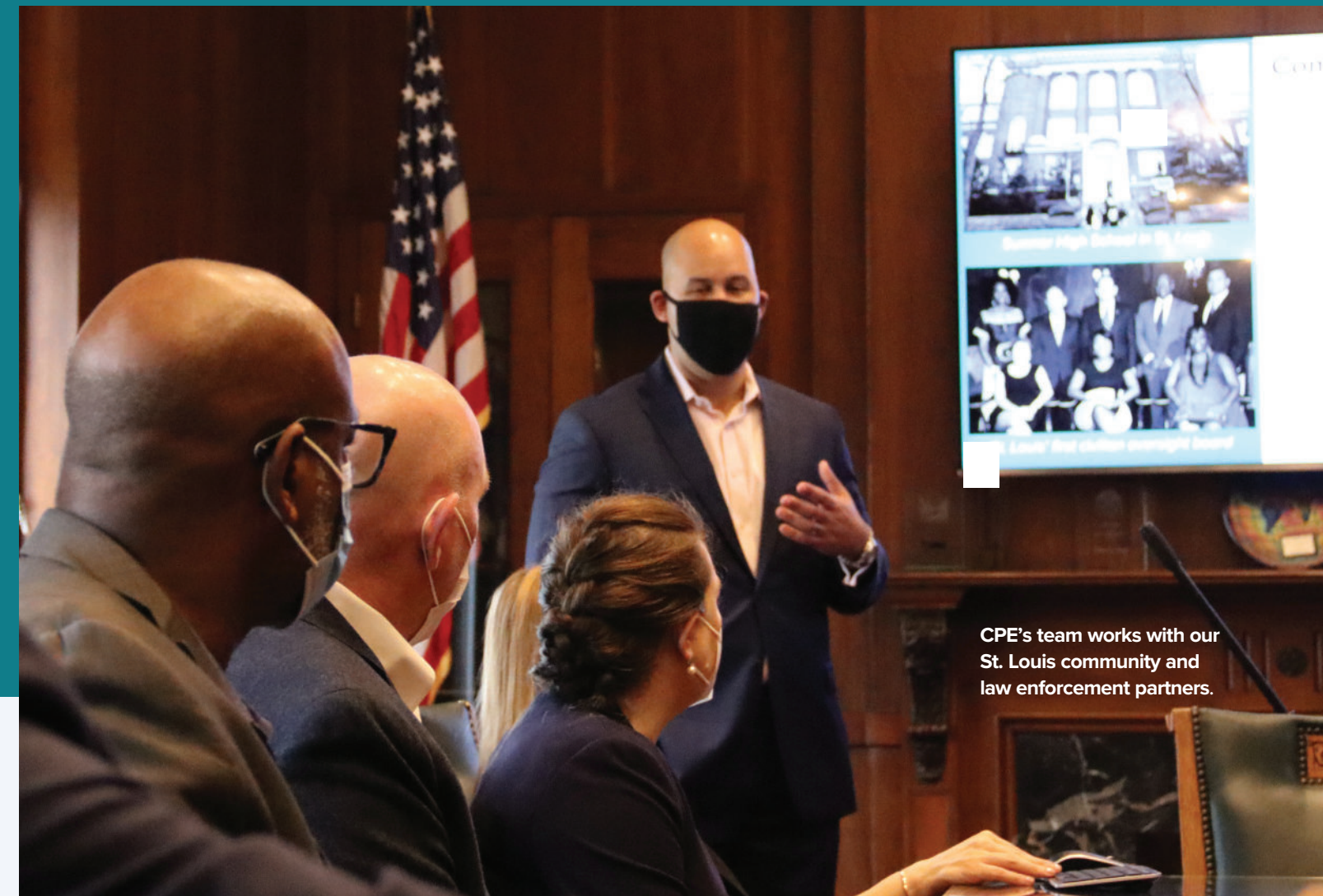
CPE's team works with our St. Louis community and law enforcement partners.

Our new series of public policy briefs tackles topics including traffic safety, policing in schools, and emergency mental health response.